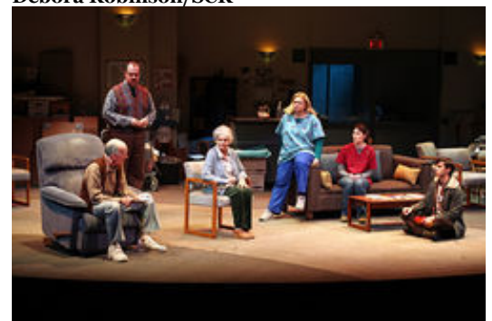
They're just there