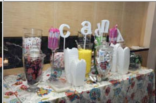
Nostalgic '70s treats from yoursweettooth.com . Pixie Sticks, candy mecklaces and pop rocks... oh my!