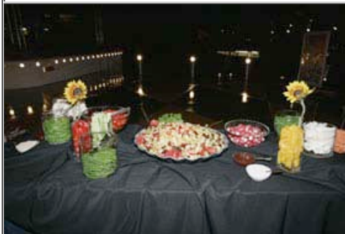
'70s fare provided by Marks Catering