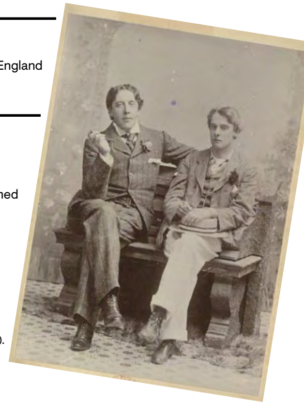
Oscar Wilde & Bosie (1893).

The Judas Kiss will be performed with a 15-minute intermission.